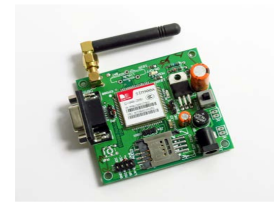
Fig. 2. GSM Module

Global System for Mobile Communications, is a standard developed by the European Telecommunications Standards Institute (ETSI).It was created to describe the protocols for second-generation (2G) digital cellular networks used by mobile phones and is now the default global standard for mobile communications – with over 90% market share, operating in over 219 countries and territories. Intimation about that trouble is possible by sending SMS (Short message service) in GSM (Global system for Mobile communication) based and GPS (Global Positioning System) based mobiles even if the mobile is not receiving network signal with the help of location based services[7]